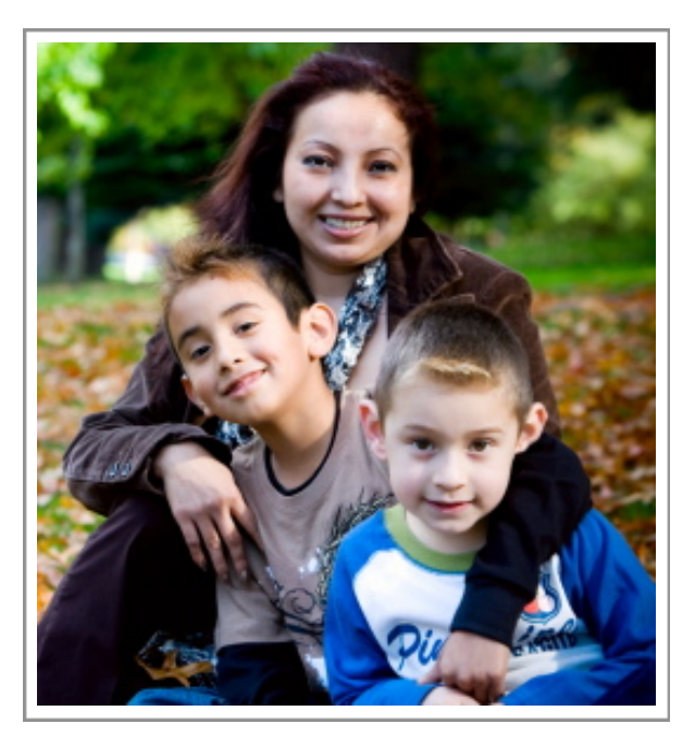
The decisions we make today about which products we use and the government policies we need to better regulate the ingredients in cosmetics may affect all of us for generations to come.

This is the most common cancer of young men in many countries, including the