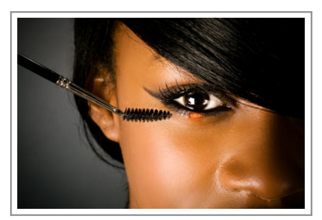
A <u>recent study by EWG</u> found that teenage girls' bodies are contaminated with phthalates and other chemicals commonly found in cosmetics and body care products

Cosmetic companies use more the 7,000 ingredients in their products. Despite decades of research showing that phthalate exposure is linked to many painful and devastating health effects, the U.S. Food and Drug Administration does not currently have the authority or the strength to intervene.<sup>57</sup>